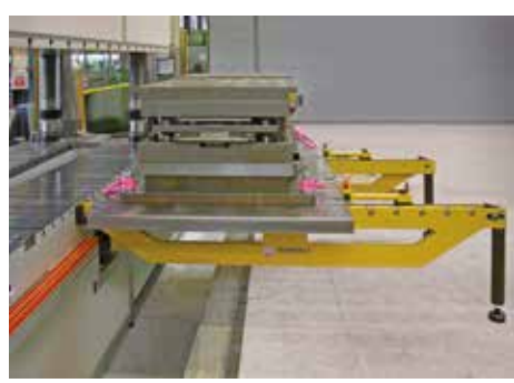
Die changing console with drive