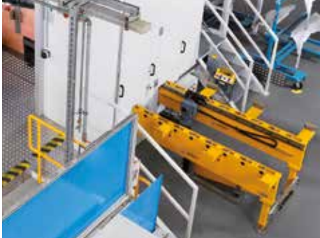
Die changing console with drive and side loading of the press.