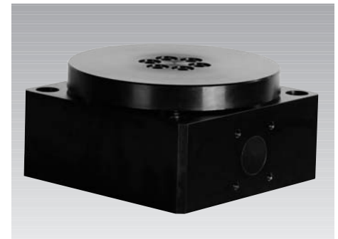
Rotating module - vertical axis DMV 1000 with flange plate Ø 170